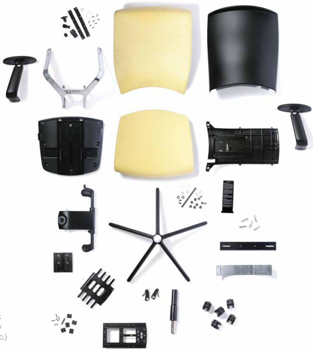
Illustration shows a typical task chair broken down by category (plastic, nylon, foam, metals etc.) prior to recycling process.